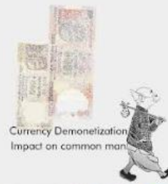
Currency Demonetization Impact on common man

An Autonomous Institute Under UGC & Shivaji University, Kolhapur College with Potential for Excellence (CPE) - Phase III. Reaccredited by NAAC, Bangalore with A+ Grade.