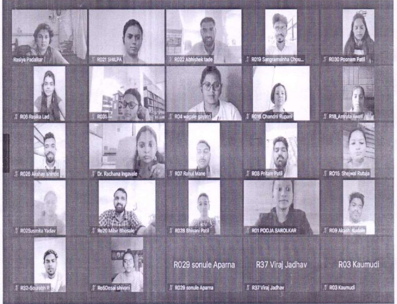
Students Participants attending online Training Programme

An Autonomous Institute under UGC, New Delhi and Shivaji University, College with Potential for Excellence (CPE) III Phase, Reaccredited by NAAC with 'A+' Grade (CGPA 3.55)